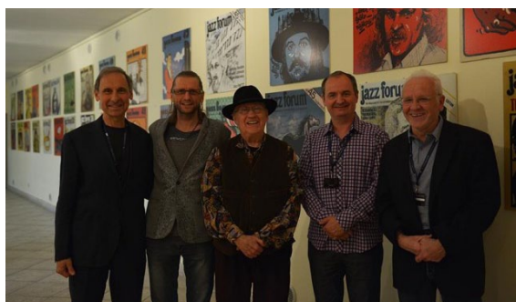
Jazz nad Odrą Jazz Festival

Jazz 2015 - on 7 December took place a special concert entitled 100 Frank Sinatra's birthday on 50 Jazz Forum anniversary.