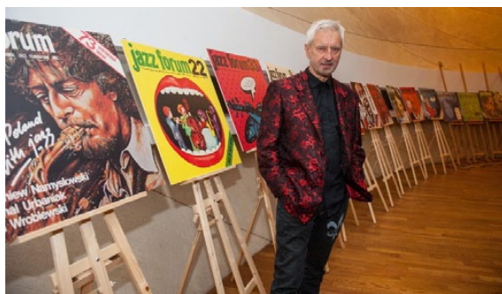
Pollin Museum, Rafał Olbiński